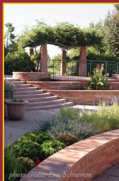
Red Butte Gardens