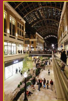
City Creek Center

Even if you can't arrive early or stay longer to see all the sights, Salt Lake City's downtown convention district abounds with restaurants, nightlife, and shopping! The convention center is next door to the City Creek Center, Salt Lake's newest shopping destination, and a short walk from the Gateway. If you prefer not to walk, six TRAX (light rail) stops provide quick transportation to destinations within the downtown area, or as far away as the University of Utah, South Valley and West Valley. It is also an easy cost-effective way to get to and from the airport. The Salt Lake City area boasts several exciting tourist destinations, including: Temple Square, Snow Bird, Red Butte Gardens and so much more.